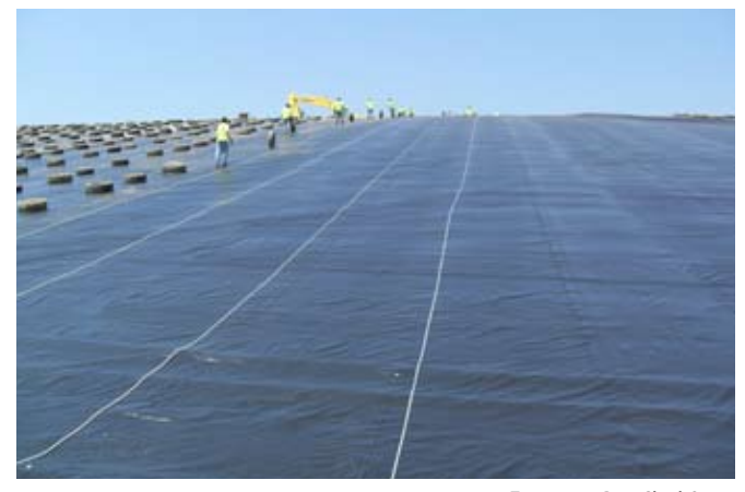
Temporary Rain Shed Cover

DURA•SKRIM 8BV and 12BV are available in a variety of widths and panels up to 100,000 square feet. All panels are accordion folded and tightly rolled on a heavy-duty core for ease of handling and time-saving installation.